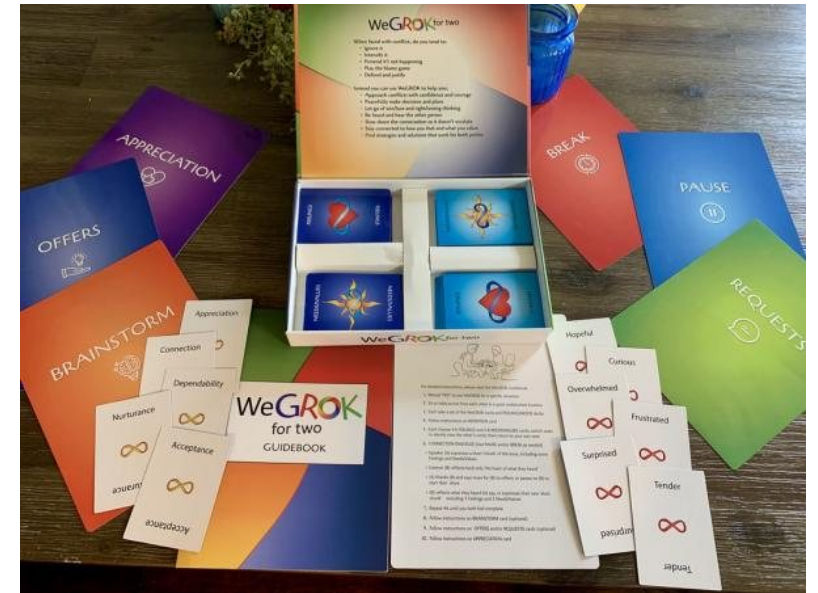
WE GROK for 2