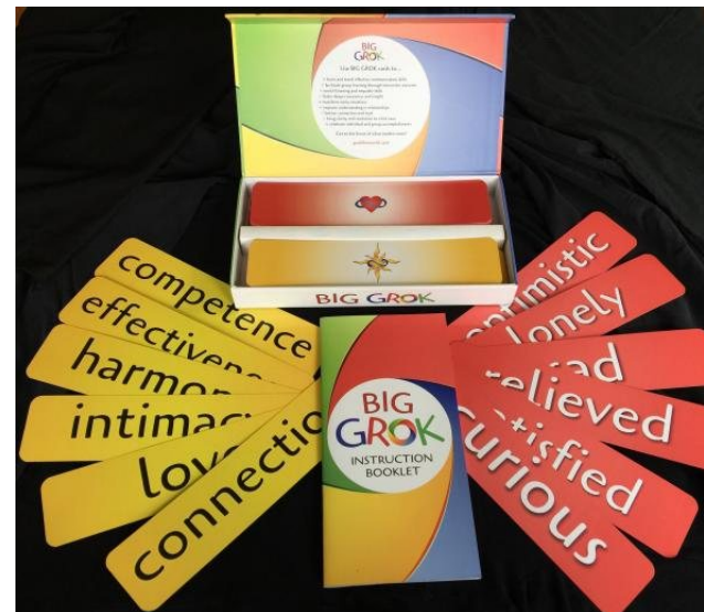
Big Grok for facilitators